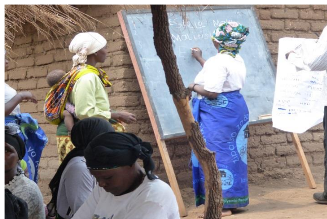
The students show their progress