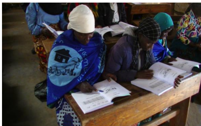
The Tulongosole group with their new tekst books

We still have € 2000 in our bank account 2 , received from the tip jar of Café Averechts, designated to finance a follow-up.